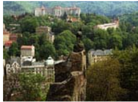
Karlovy Vary – Czech

Depart after breakfast east for the Czech Republic and the magnificent city of Prague. The Czech capitol is one of the finest examples of European mediaeval architecture and hundreds of cobble lined streets with spiralling towers are filled with all types of shopping and entertainment. Upon arrival, hotel check in then met by your local city guides for a 3 hour tour which begins at Castle hill, ending in St. Wenceslas square. After the tour coach transfer back to the hotel for the evening dinner.