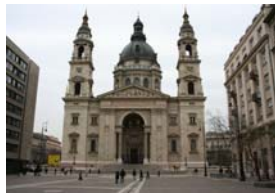
St. Stephen's Cathedral

Buffet breakfast followed by a 2 hour coach city tour with local guides visiting places of interest including the thermal spa, Fisherman's Bastion, Castle hill and St. Matthias church. Free time for lunch and shopping before a mid afternoon rehearsal then return to the hotel to change and freshen up. Coach transfer to the venue for this evening's concert and afterwards dinner in the Művész étterem restaurant, a fitting end to this visit.