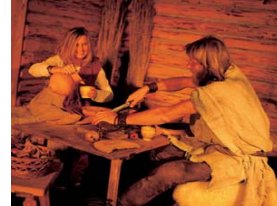
bread, drippin' & cordial