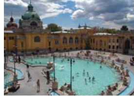
Thermal spa pool