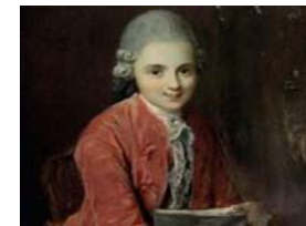
Mozart at 14