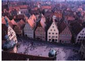
Rothenburg main square

After breakfast enjoy a morning music workshop with local musicians who will explain the finer points of Bavarian composition and technique. During the afternoon rehearsal in the concert venue if the evening should be the time and place otherwise and afternoon concert in one of Rothenburg's Old Town churches. After concert dinner in a traditional local restaurant.