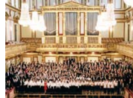
Golden Hall performance