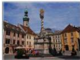
Sopron city centre

Depart Budapest after breakfast for Sopron which is located on the Hungarian / Austrian border and made famous by Joseph Haydn who studied and wrote many of his pieces there. Stop in Sopron for a look around and purchase lunch. Continue to Eisenstaedt just inside the Austrian border and visit the Esterhazy Estate palace with a one hour guided tour. Continue west and enjoy the picturesque scenery with arrival into Salzburg late afternoon. Dinner arranged in the hotel and afterwards free time to relax.