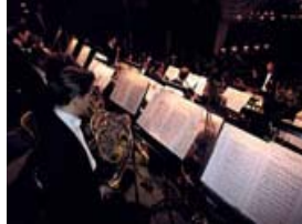
Opera House performance