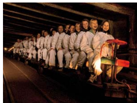
Going down! first floor salt

After breakfast a visit to the Hallein Salt Mine just outside of Salzburg. A fun tour beginning with dressing in the miner uniform, train ride underground, boat travel with lighting and music to enhance the visit. Afterwards depart for Vienna with a stop en route for lunch and check in once arrived to the hotel. Free time to relax and freshen up then dinner in the hotel.