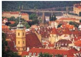
Little Quarter Prague

Buffet breakfast in the hotel then free time in the Old town for shopping and sightseeing, possibly visit the Little Quarter or visit one of the many museums. Time for lunch then meet in the centre for a mid afternoon rehearsal in an Old town church venue. After the rehearsal transfer back to the hotel to change then return for the evening concert. An after concert dinner arranged in a local Czech restaurant then return coach transfer to the hotel.