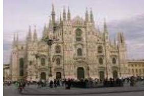
St. Stephen's Cathedral

Final day of the tour and most fitting that it is spent in one of Europe's finest classical music cities. This day will be at leisure to explore and prepare for the journey home. Mid afternoon rehearsal in the concert venue then return to the hotel to freshen up before returning for this evening's farewell concert in one of Vienna's fine churches or halls. Afterwards a lavish farewell dinner with musicians to entertain.