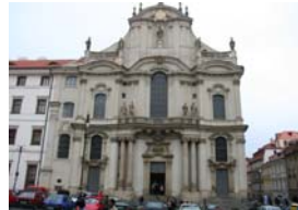
St. Nicholas church