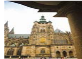
St. Vitus Cathedral