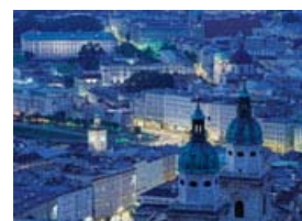
Salzburg by night