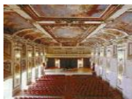
Great Hall in Eisenstaedt